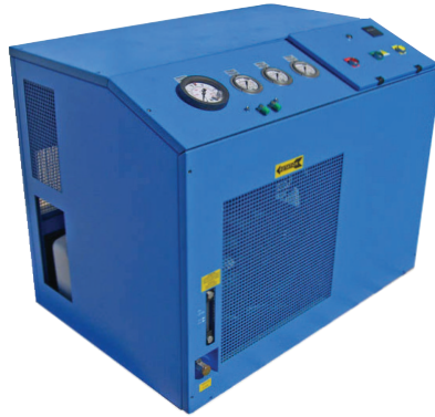
Gasoline, Diesel or Electric Fill Compressors from 3.5 to 26 cfm