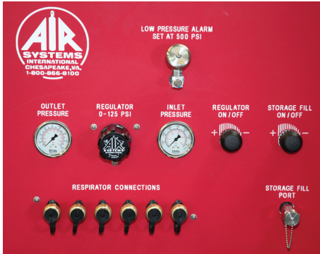
Custom cascade air control panels to manage entire fill system

Air Systems' experienced technical staff and engineering department can design a mobile breathing air response system tailored to your exact requirements. Contact Customer Service to discuss your requirements and we will provide AutoCad® drawings to meet your specifications.