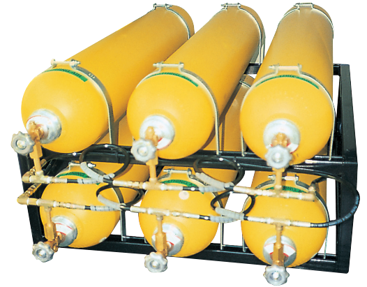
Air Storage Systems in horizontal or vertical configurations for large air cylinders