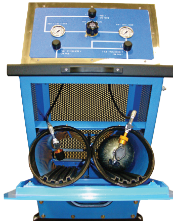
NFPA Compliant Full Containment Fill Stations from 2 to 4 cylinder fill positions