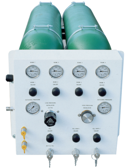
Slide in vehicle rack systems to upgrade rescue vehicles